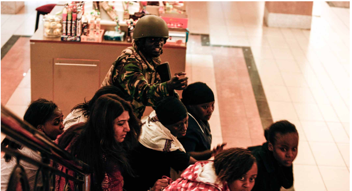
A soldier directs people up stairs inside the Westgate shopping mall after a shootout in Nairobi, Kenya, 21 September 2013.

We might consider dedicated CVE aid projects working with appropriate non-government organisations, such as the Global Community Engagement and Resilience Fund (GCERF; see box), and the private sector. Australia could consider piloting some small-scale CVE programs in Bangladesh or Kenya, both of which face CVE challenges among their extraordinarily youthful populations.