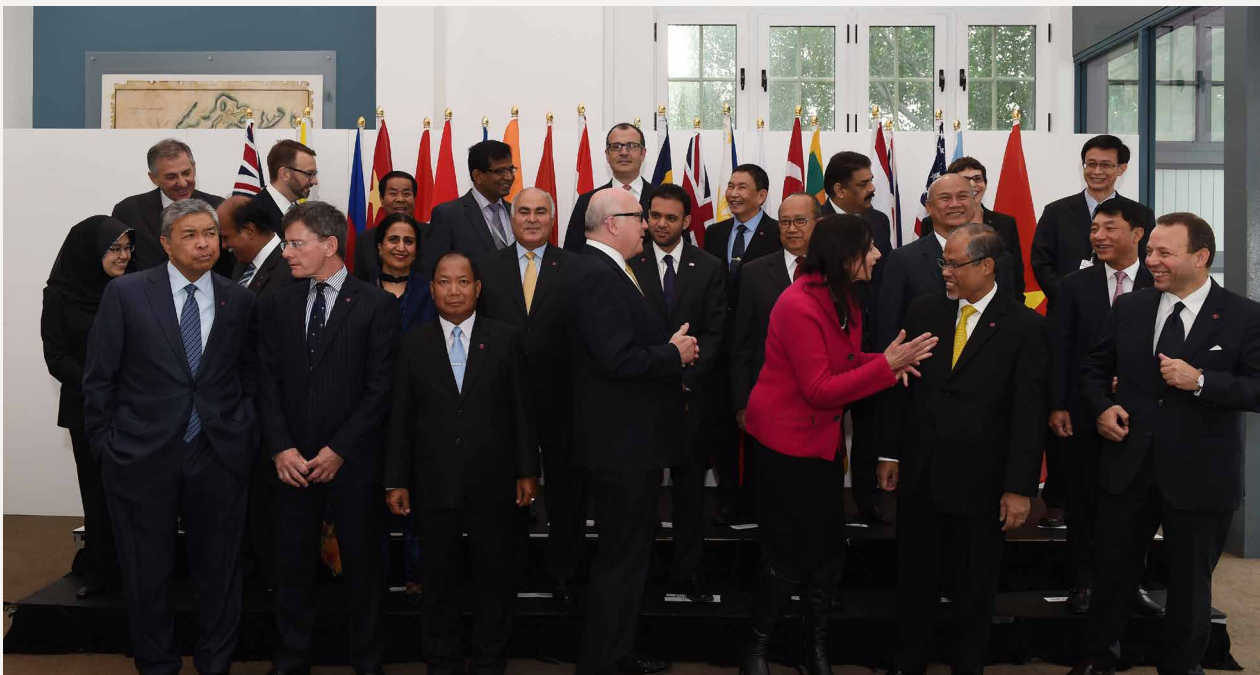
Delegates chat following the official photo during the Regional Countering Violent Extremism Summit in Sydney, 12 June 2015.

With the decision to integrate AusAID into DFAT to better support Australian foreign policy, our aid program should be playing a more prominent role in CVE and CT.